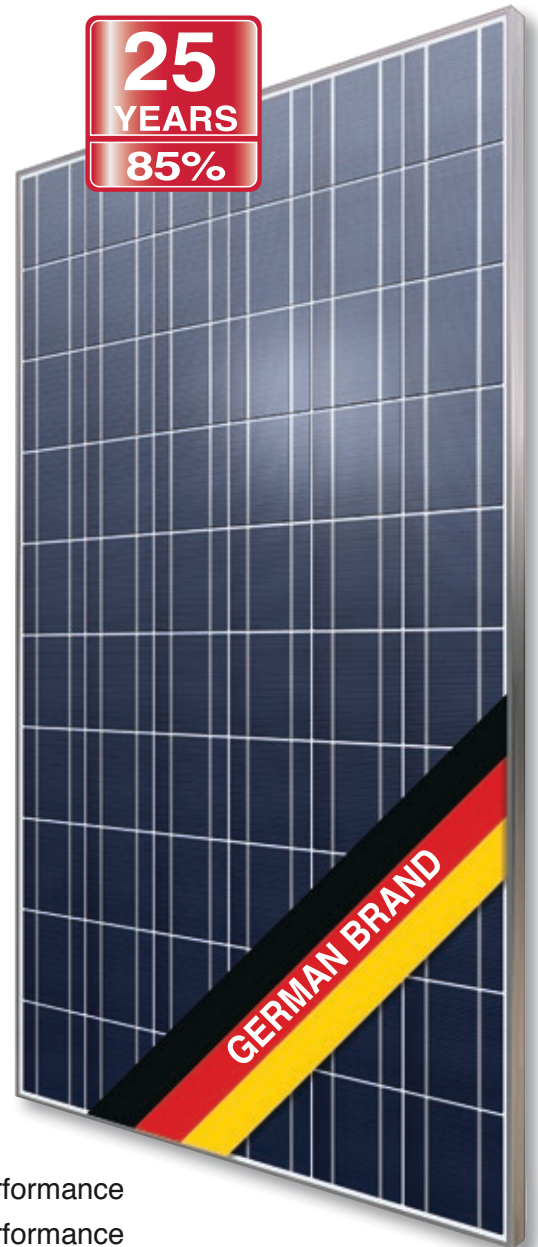
Fig. similar 60P156EN170313A

Exclusive linear AXITEC high performance guarantee!